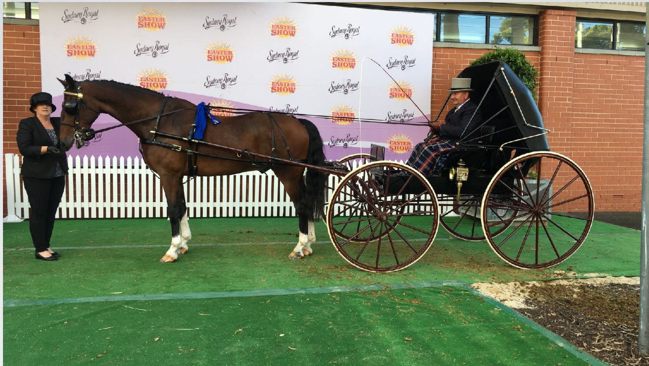
HARNESS TURNOUT Max Pearce